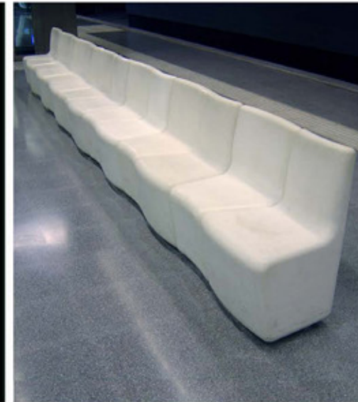
↑ | Linear composition