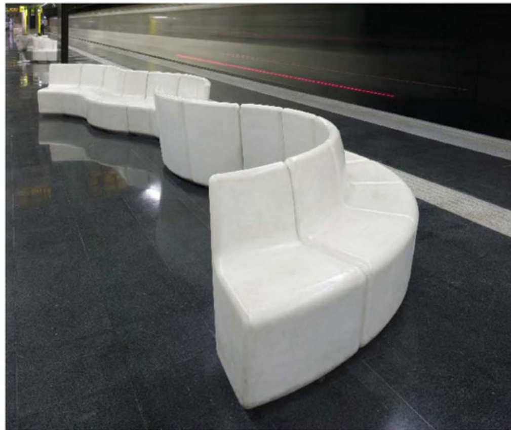
↑ | Row of concave and convex seats

Client: Paviments MATA. Completion: 2007. Production: serial production. Design: individual design. Functions: seating. Main materials: concrete.